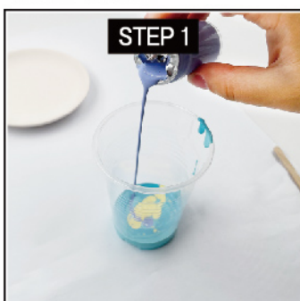
Find a stick and a cup (not included), pour in the paint.