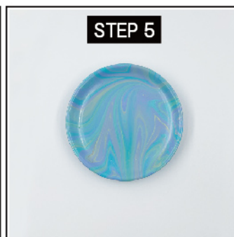
Air dry the trinket dish until the paint is completely dried.

⚠ WARNING: CHOKING HAZARD - SMALL PARTS. NOT FOR CHILDREN UNDER 3 YEARS.