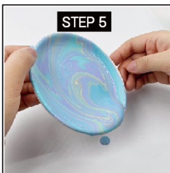
Turn the trinket and let the paint flow over the trinket dish.