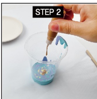
Squeeze the gold paint in.