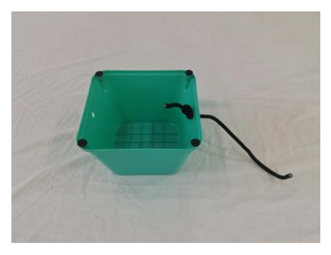
Please feed each rope through the hole on the side of the bucket. Refer to diagram to the left. The knot is to be made inside the bucket.

This box contains 6 buckets and 6 ropes.