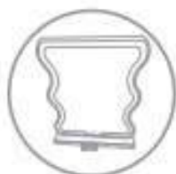
Wavy LED Mirror