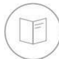
Product Instruction manual