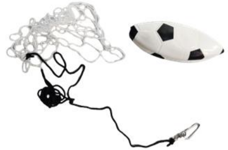
1pc soccer ball, 1pc string on hook, 1pc net