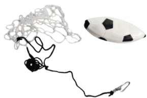
Soccer ball parts set

Step 4: Take out soccer ball parts set, then hand pump the ball. Put the inflated soccer into white net, knot the net opening tightly by black string.