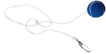
1set tennis ball on string & hook