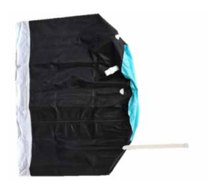
Step 2: Fully inflate the top ring with air pump (Not included), then press the air valve inside to let the surface is in flat.

Step 1: Slide the 6pcs Tubes into Portable Bath from the hole.