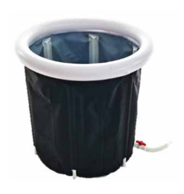
Step 3: Connect the Outlet Hose to the water valve, adjust the hose length accordingly.