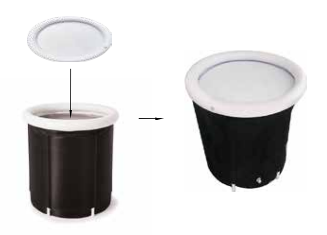
Step 5: Only for cloth cover. Put the black cloth cover over the top ring and then tighten the rope.