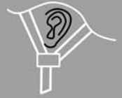
DIAGRAM B: TRIGLIDE

STEP 4: Always wear the helmet with the chin strap buckle fastened and the strap pulled tight. Make sure the strap is well back against the throat, NOT on the point of the chin. Straps worn on the point of the chin increase the chance of the helmet coming off in an accident. See Diagram C and Diagram D on how to fasten and release the buckle and Diagram E shows the proper placement of the chin strap.