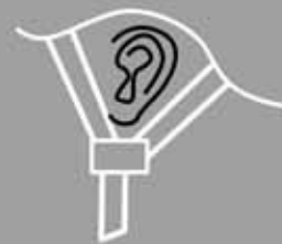
DIAGRAM B: TRIGLIDE

STEP 4: Always wear the helmet with the chin strap buckle fastened and the strap pulled tight. Make sure the strap is well back against the throat, NOT on the point of the chin. Straps worn on the point of the chin increase the chance of the helmet coming off in an accident. See Diagram C and Diagram D on how to fasten and release the buckle and Diagram E shows the proper placement of the chin strap.