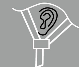
DIAGRAM B: TRIGLIDE

STEP 4: Always wear the helmet with the chin strap buckle fastened and the strap pulled tight. Make sure the strap is well back against the throat, NOT on the point of the chin. Straps worn on the point of the chin increase the chance of the helmet coming off in an accident. See Diagram C and Diagram D on how to fasten and release the buckle and Diagram E shows the proper placement of the chin strap.