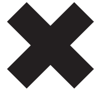
Crosses x 5pcs