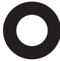
Nought x 4pcs