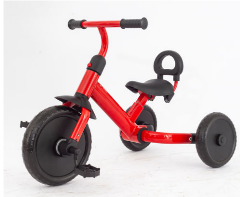
Riding Mode 2