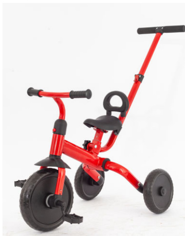
Riding Mode 1