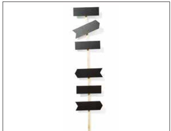
4. The assembly is complete, as per image.