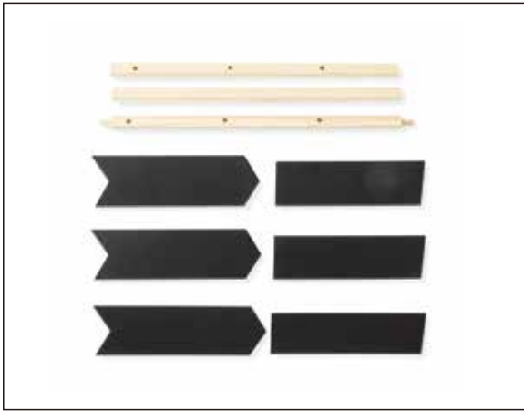
1. All components as per image.