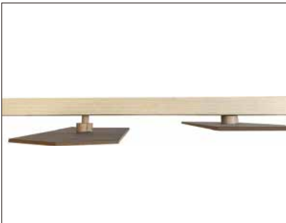
3. Assemble the 6 blackboard onto the rods. Make sure the rib (the raised edge) is aligned with the ridges within the rod tunnel.