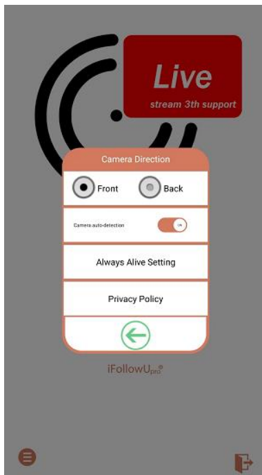
App setting screen