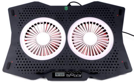
Keycode: 43155330 Laptop Stand with Fans RGB

To ensure optimum performance and safety, please read this instructions carefully before operating this product.