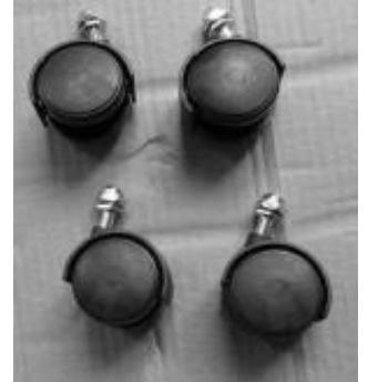
Castor Wheels x4