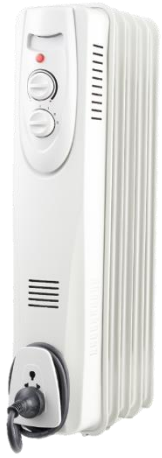
Main Body x1