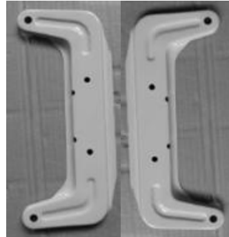
5 Fin Castor Plates x2