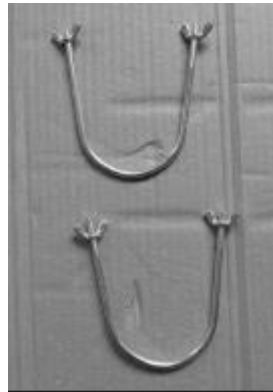
U-shape Bolt x2 Wing Nut x 4