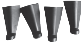
4X Sturdy stable foot