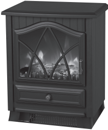
1X Heater body